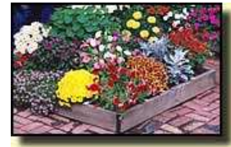
www.squarefootgardening.com Author: Mel Bartholomew